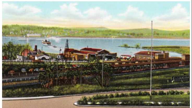
Beacon Waterfront - 1949